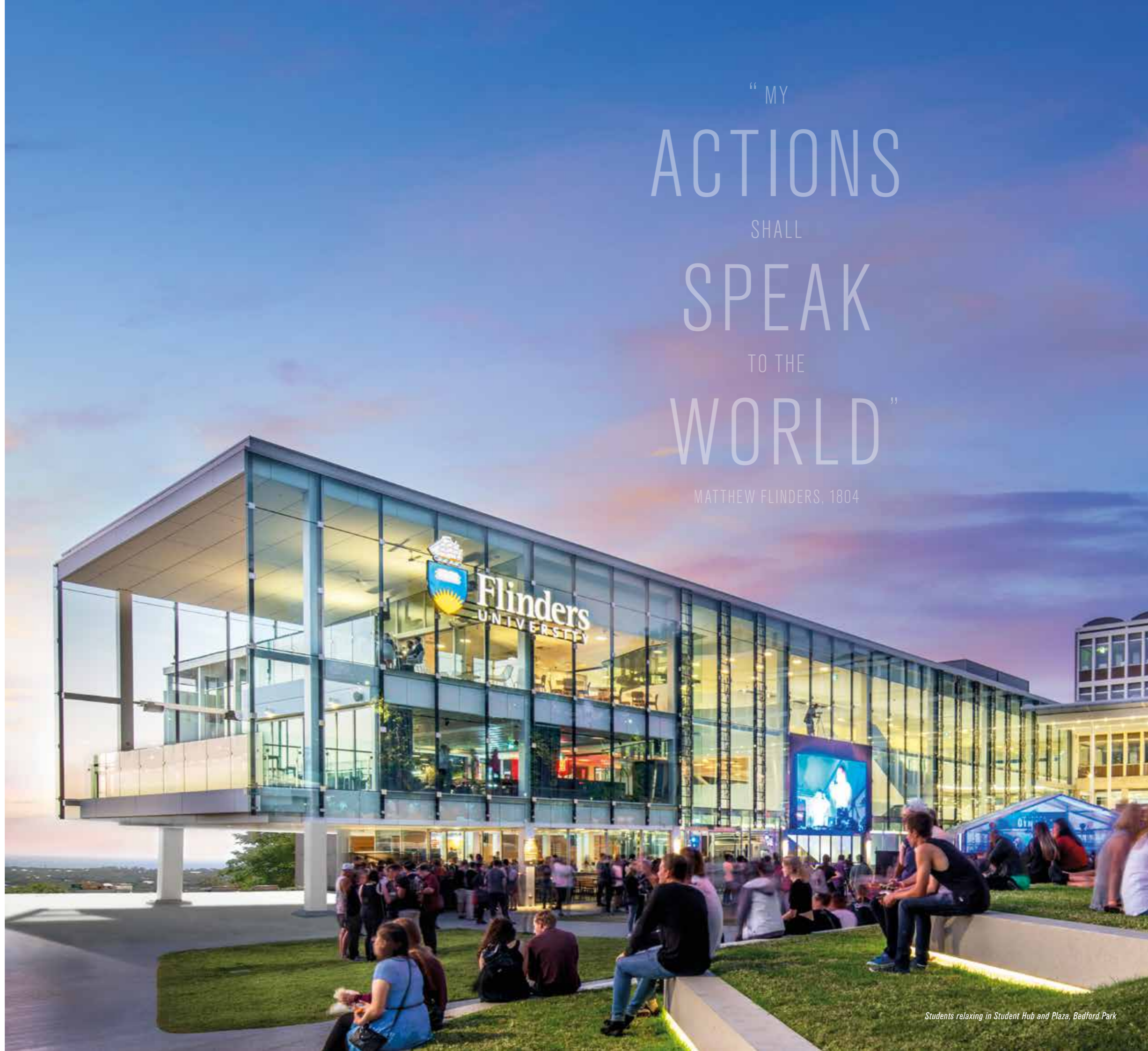
Students relaxing in Student Hub and Plaza, Bedford Park