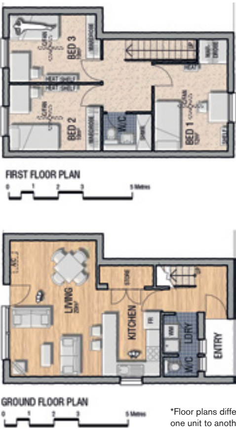
Example layout for a three-bedroom unit. Typical Unit 1-22*

*Floor plans differ from one unit to another.