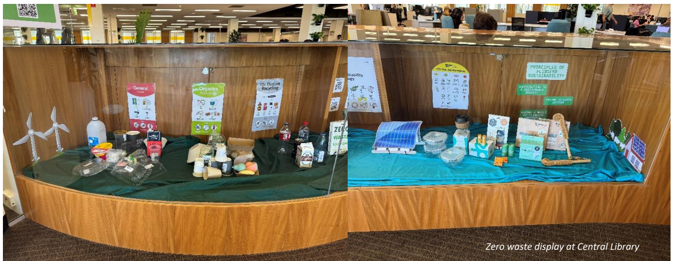
Zero waste display at Central Library