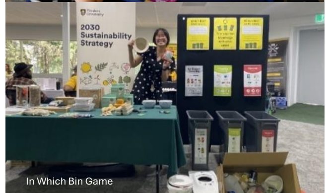
In Which Bin Game