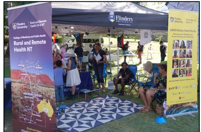
Photo: Activity at the Jingili Water Gardens NAIDOC Family fun day, July 2024.

The NAIDOC family fun day at Jingili Water Gardens in Darwin was the perfect celebration to showcase kidney health and eGFR3 Study activities. The eGFR3 Kidney Health Study created a chill out zone to engage with community and share information about the eGFR3 Study and Flinders University as a study option in the NT. The eGFR3 Study Community Governance banner stood alongside Flinders University banners. Flinders University, Rural and Remote Health and eGFR3 Study were well supported by staff and public.