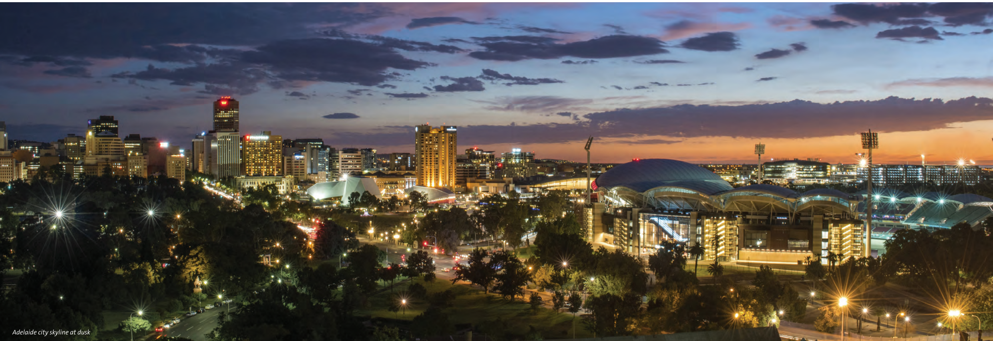
Adelaide city skyline at dusk

Adelaide's primary and secondary schools – both government and private – also boast a reputation for excellence and pastoral care. No longer a secret, Adelaide is a highly attractive city designed for living life to the fullest.