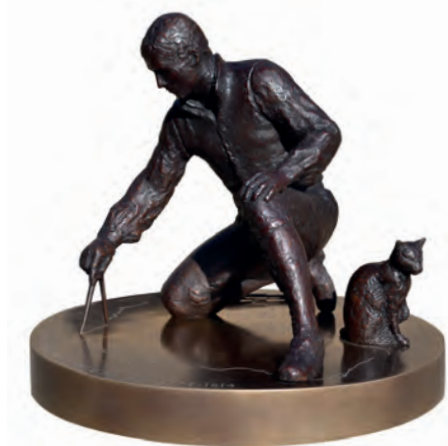
Matthew Flinders maquette

We have already taken our first steps to greater sustainability – we are home to one of South Australia's largest solar arrays, with more planned for the future. We are actively using and promoting new transport technologies including solar, electric and autonomous vehicles. Our sustainability projects support large and local scale on-campus initiatives that create positive change such as a market and community gardens and new student-led projects to reduce waste. And our researchers and educators are looking for new ways to minimise our greenhouse gas emissions and create a carbon positive future.