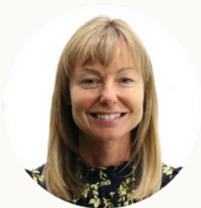
Vice-President and Executive Dean