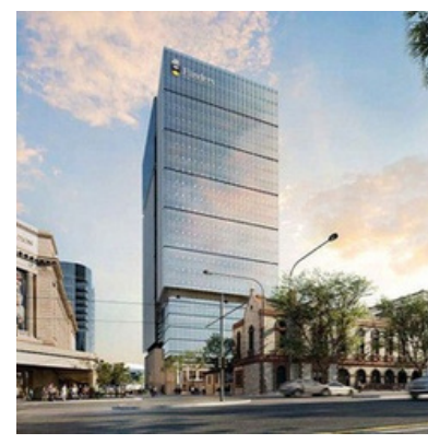
Flinders City Campus

Flinders at Tonsley is an innovation hub for teaching, research and industry in computer science, IT, engineering and maths. It's home to the New Venture Institute start-up incubator and Line Zero research hub. The Flinders Factory of the Future advanced manufacturing test site, co-located on campus, is set to open mid-2025.