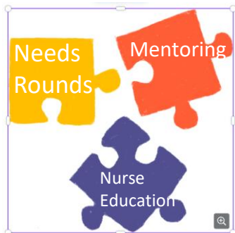
Fig 1. Project overview