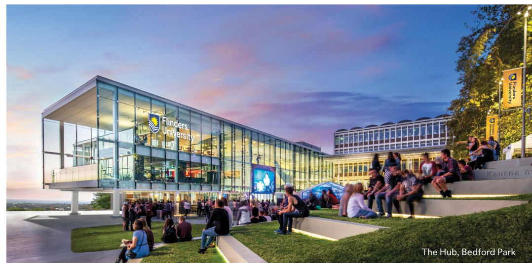
The Hub, Bedford Park

Along with some of Adelaide's biggest businesses and globally-recognised organisations, Tonsley is also home to the Flinders Medical Device Research Institute (MDRI) and Institute for Nanoscale Science & Technology. Flinders' Tonsley campus is also an incubator for entrepreneurs and future employers who are creating next generation start-ups through the Flinders New Venture Institute.