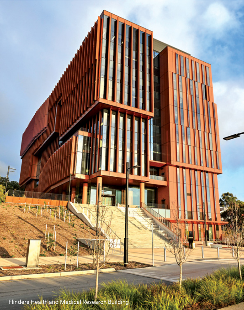
Flinders Health and Medical Research Building