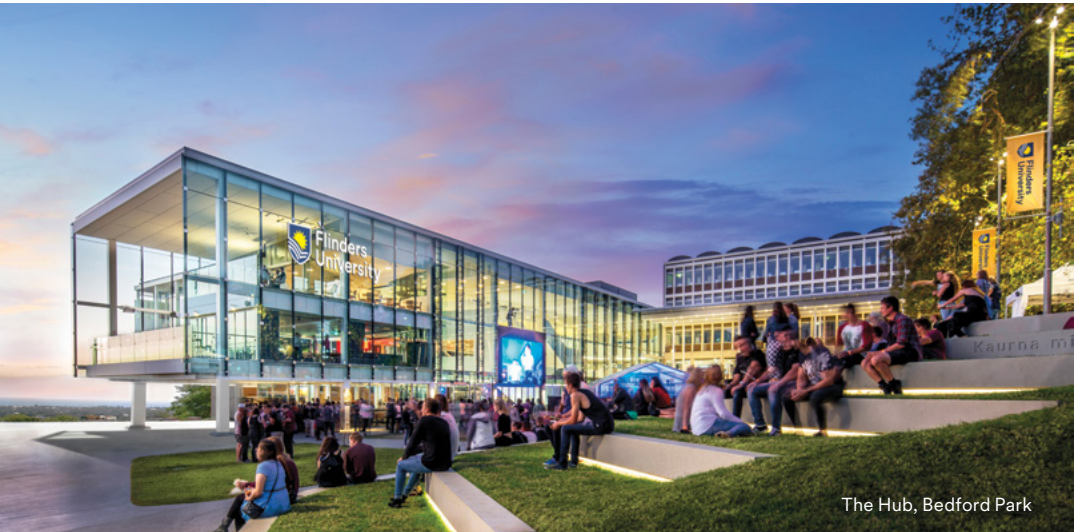
The Hub, Bedford Park

Along with some of Adelaide’s biggest businesses and globally-recognised organisations, Tonsley is also home to the Flinders Medical Device Research Institute (MDRI) and Institute for Nanoscale Science & Technology. Flinders’ Tonsley campus is also an incubator for entrepreneurs and future employers who are creating next generation start-ups through the Flinders New Venture Institute.