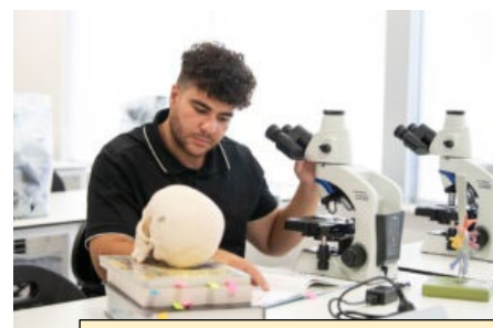
SARM program student

Students will be required to live in/relocate to the rural location they are offered. Subsidised accommodation and travel for rotations to other sites in years 3 and 4 will be available. Students will be required to source their own accommodation for the first two years.