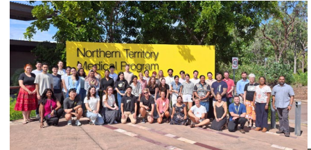
NTMP celebrated a major milestone with Yr 1 2025 students and staff.

Up to 24 places (Employer Reserved – Fee Paying) are available. The NTBMS is an NT and Australia Government initiative with the aim of improving the health of all Northern Territorians, particularly Aboriginal and/or Torres Strait Islander Territorians; increasing the number of Aboriginal and Torres Strait Island doctors; and to provide a sustainable supply of medical graduates to the NT health community. Selection is prioritised per the information below.