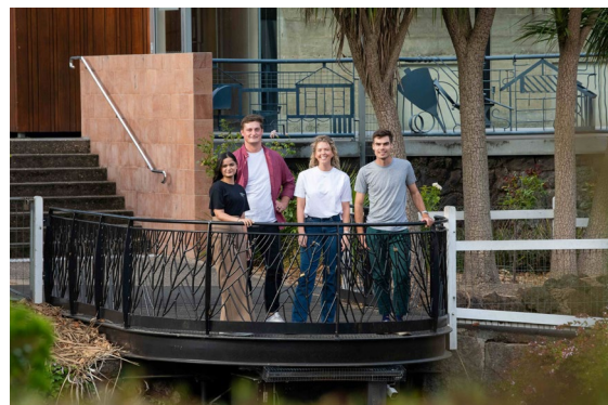
SARM program students at Mt Gambier.