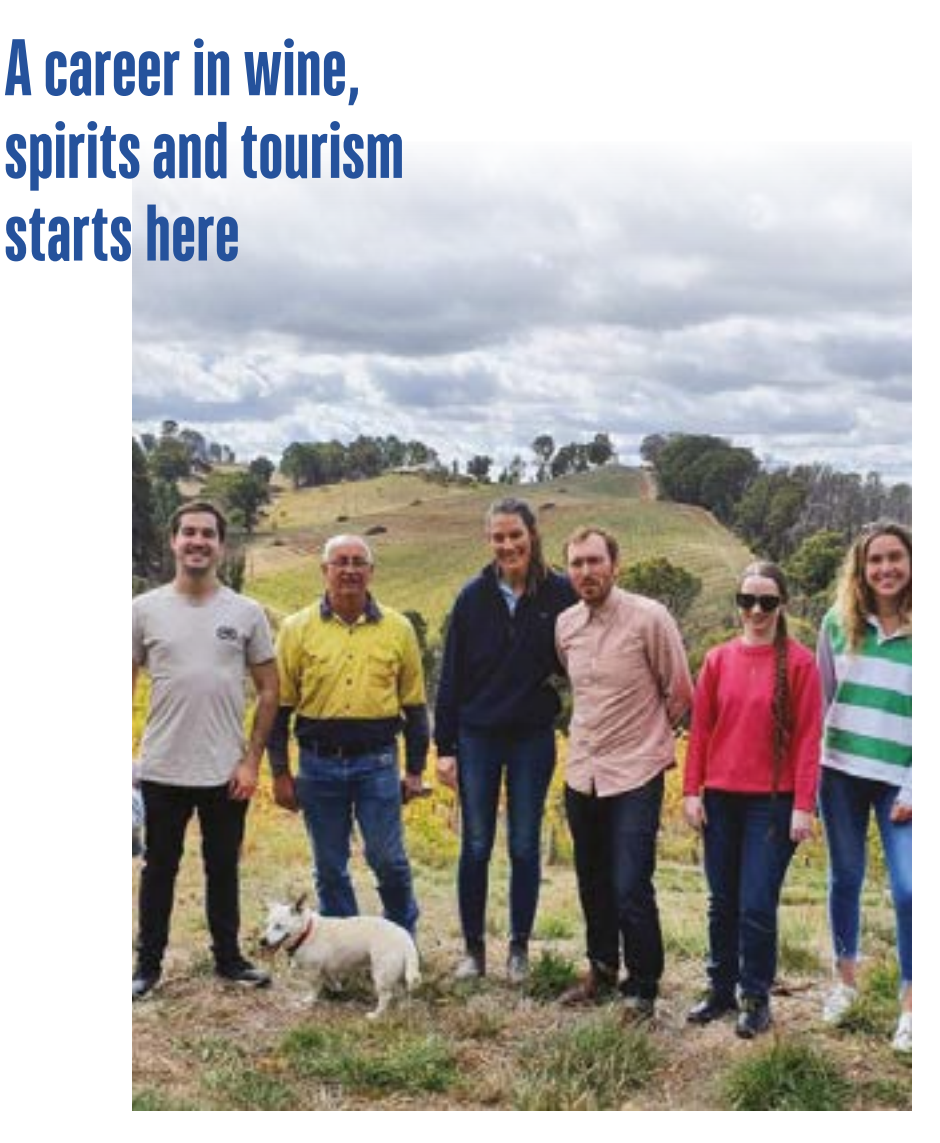
Flinders students and winemaker on a study tour in the Adelaide Hills in April 2021.