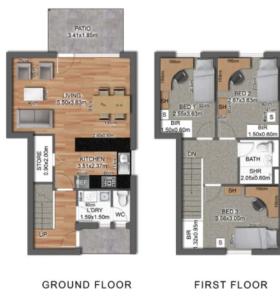
Example of unit in Deirdre Jordan Village