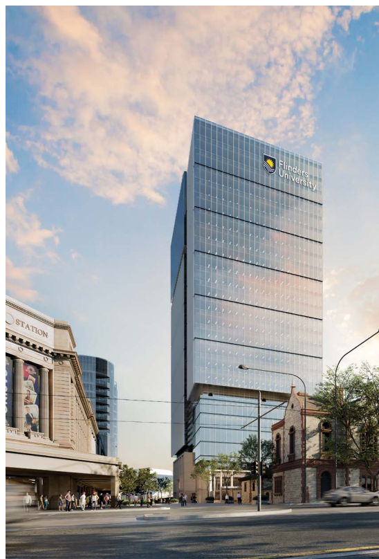
Artists impression - Flinders City Campus at Festival Plaza