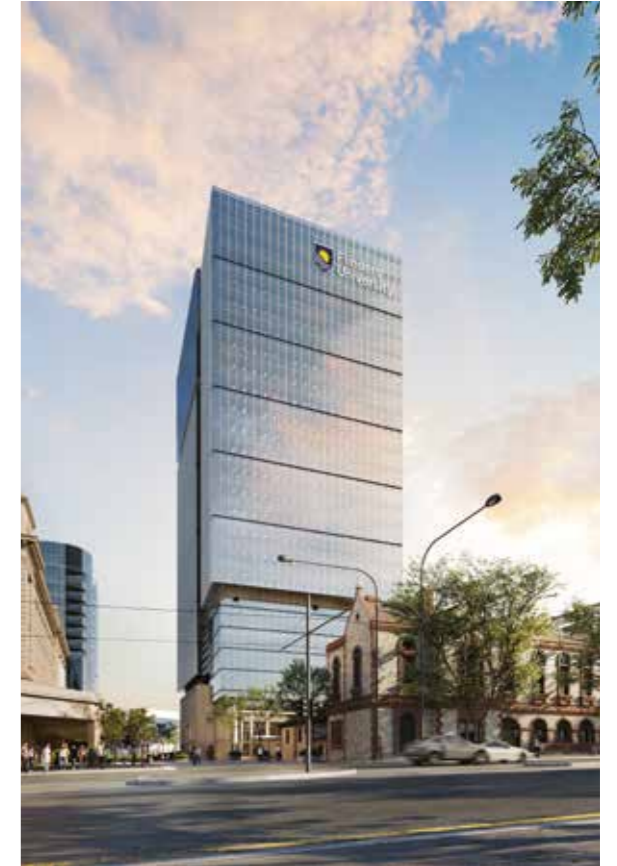
Many law and criminology courses will be available at Flinders at Festival Plaza from 2024.

Flinders University acknowledges the Traditional Owners and Custodians of the lands and waters on which its campuses are located. These are the Traditional Lands of the Arrernte, Dagoman, First Nations of the South East, First Peoples of the River Murray & Mallee region, Jawoyn, Kurna, Larrakia, Ngadjuri, Ngarrindjeri, Ramindjeri, Warumungu, Wardaman and Yolngu people. We honour their Elders past, present and emerging.