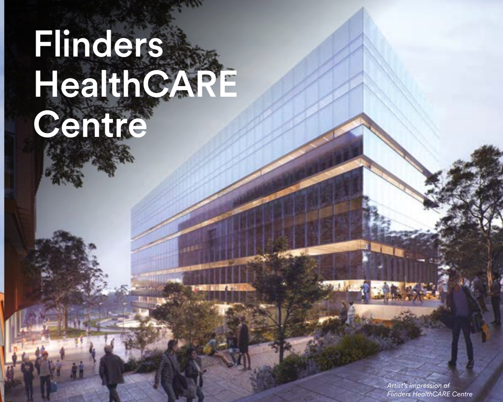
Artist's impression of Flinders HealthCARE Centre

Flinders University's new, $300 million state-of-the-art health service for South Adelaide will be a game changer for the community, delivering better care, faster access, and a stronger health workforce.