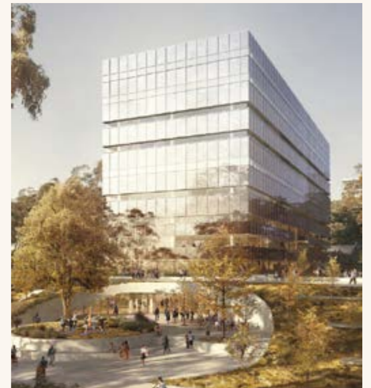
Flinders HealthCARE Centre artist's impression.

Design and development is expected to begin later this year, with Flinders University targeting construction to start in 2027.