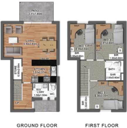
Example of unit in Deirdre Jordan Village