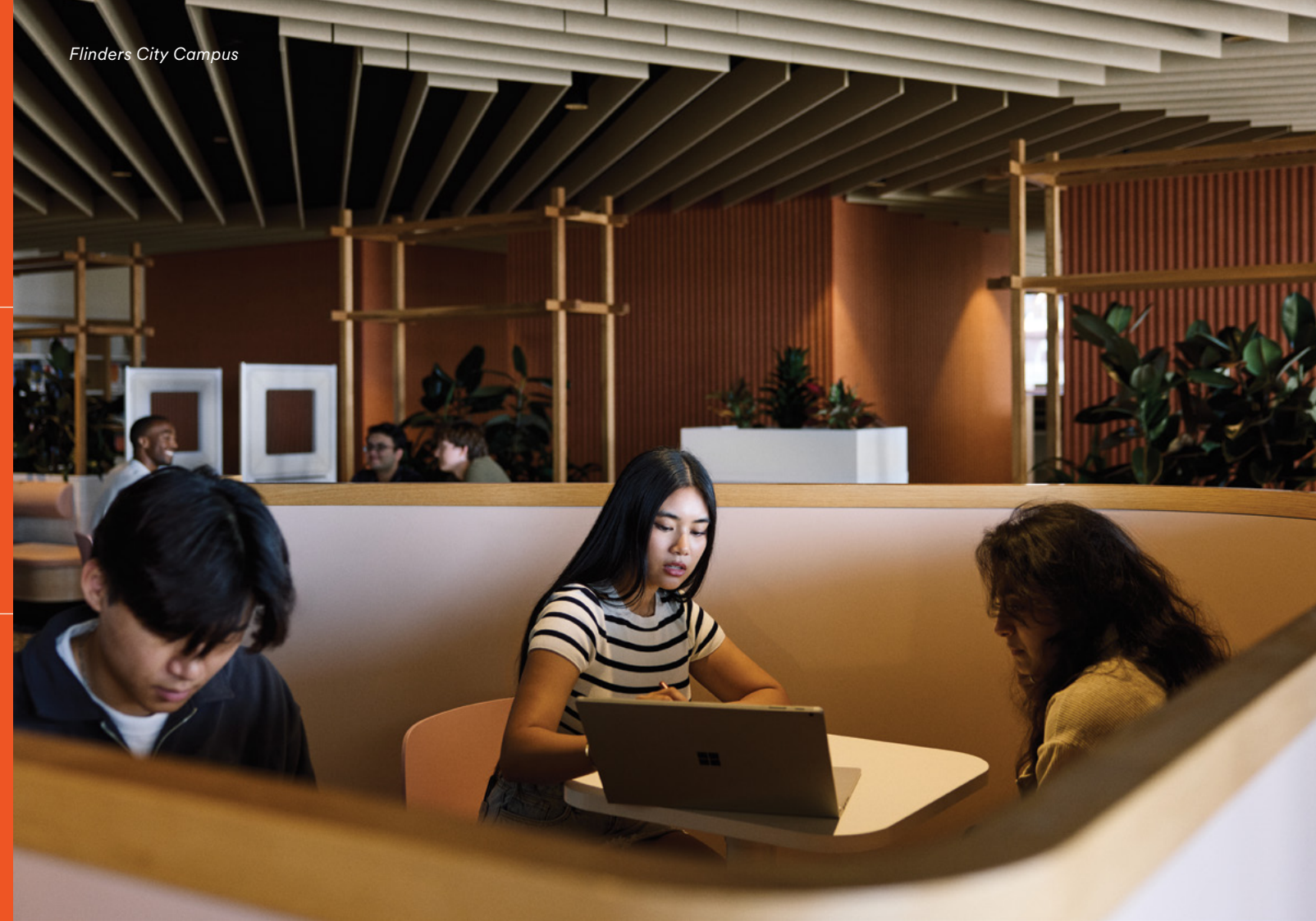
Flinders City Campus

Whether you are enjoying the leafy surrounds of the Bedford Park campus, immersed in the CBD at our city campus at Festival Plaza, contemplating the industries of the future at Tonsley campus, or located at any of our rural and remote locations, Flinders prides itself on offering students a great on-campus experience.